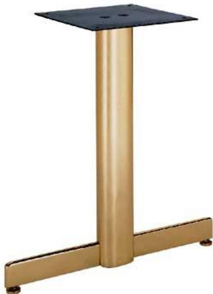
Single Column T-Base